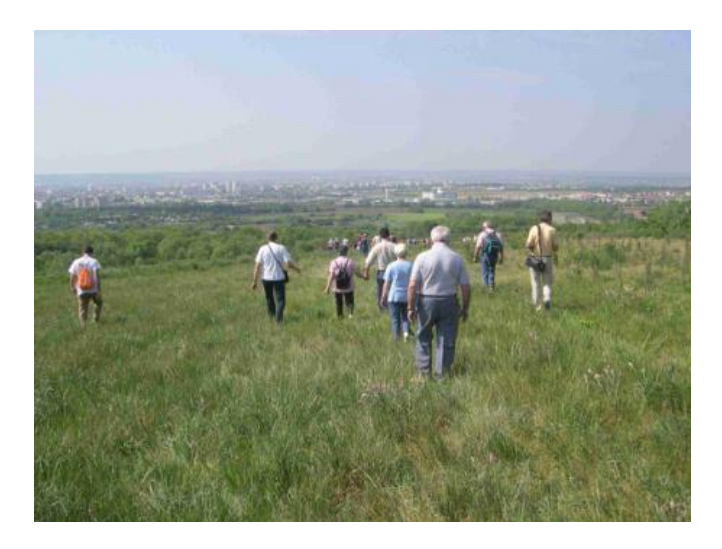
Part of the site in process of being landscaped (seeded with grasses or planted with trees). The area is being opened to the public in stages.