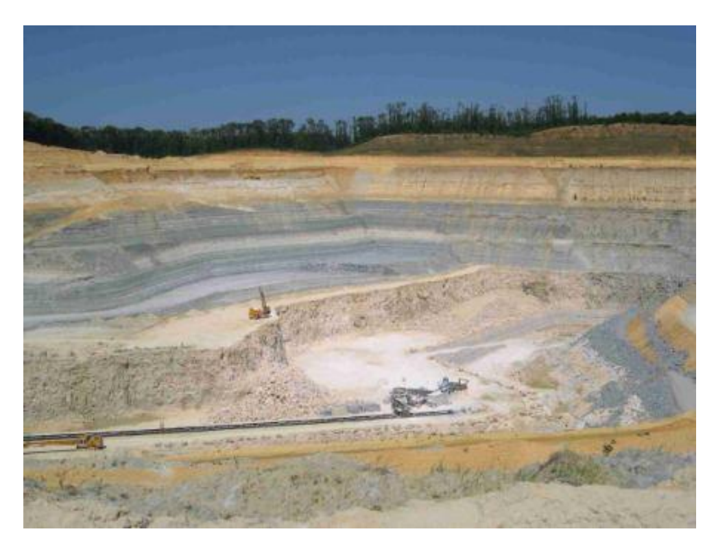
The quarry in 2003. After cessation of cement production, only the gypsum was removed; all other material was used to backfill the pit. The cutting face had reached the northern limit of the hill, and shifted to the west.

The following article was published in 2007, when the quarry was still operating with a pit depth of 100 metres and restoration efforts were underway. (A decade later, open-cast extraction has been discontinued, and roughly half of the pit has been filled, revegetated and opened to the public; wild orchids have returned; and gypsum extraction is continuing with underground mining.)