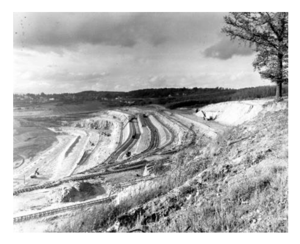
The Lambert quarry in the 1950s. Mechanisation accelerates production. Benches mark the separations between the various geological strata. Narrowgauge diesel locomotives and wagons run on the tracks laid on each bench, under each cutting face.